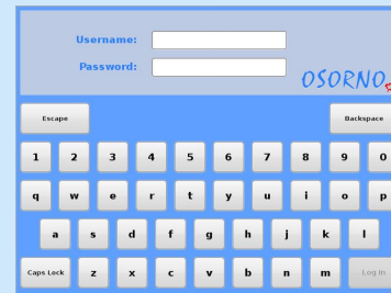
Access SCADA screen of Osorno systems